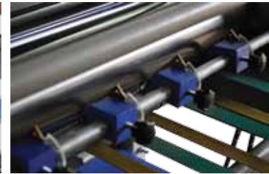
Unique Returner System For 70 Gsm To 1000 Gsm Paper/board Feed