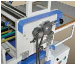
Removable Roller System For Cleaning