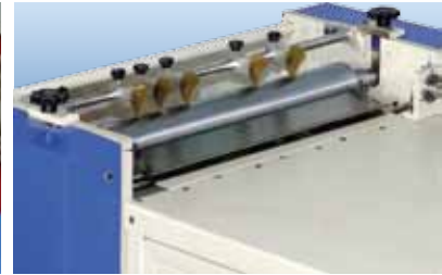
100 Micron Thick Hard Chrome Plated Roller/ SS Rollers (Optional)