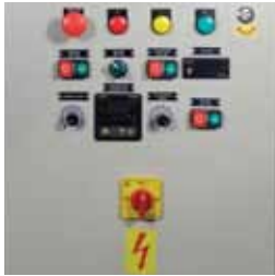
Control Panel With Digital Counter & Heater Display