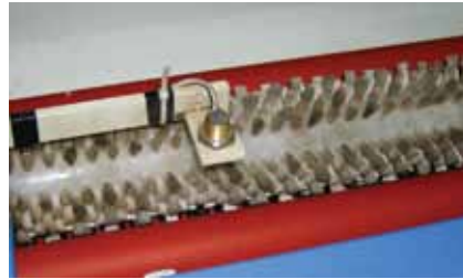
Replaceable Brush Turning System For Thin And Thick Boards