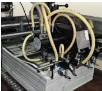
High Speed Stream Feeding Head