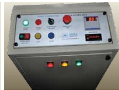
Independent Control Panel with Digital Sheet Counter & RPM Meter